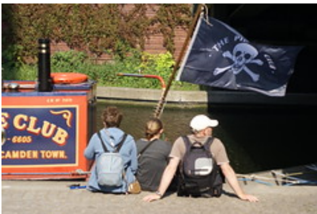
[11] Cavalcade 2011 [11]